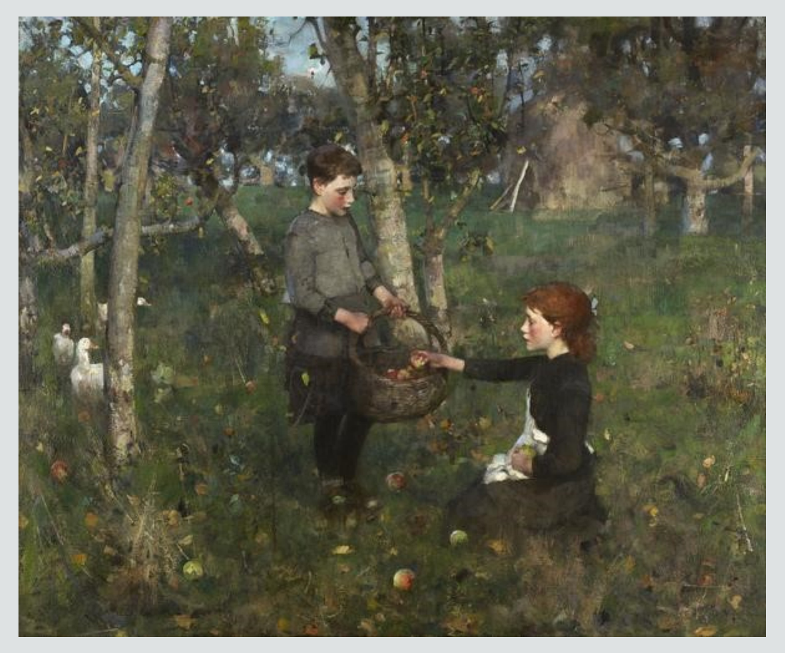
This is a painting. It was made in 1886 and Sir James Guthrie made this picture. I think the person who painted this picture was maybe inspired by a real event.

In this picture I can see a boy and a girl picking apples. And they look so tired. I can see the colours green, red, black, white, brown and gray. Clothes, trees, baskets, shoes and materials are depicted in this painting. This picture reminded me of a scene in a movie. The parents did not have money and when the children went to play in the garden one day, they found a house and one by one they went to pick the apples by that house. Then the owner of the house saw them and the owner got angry.