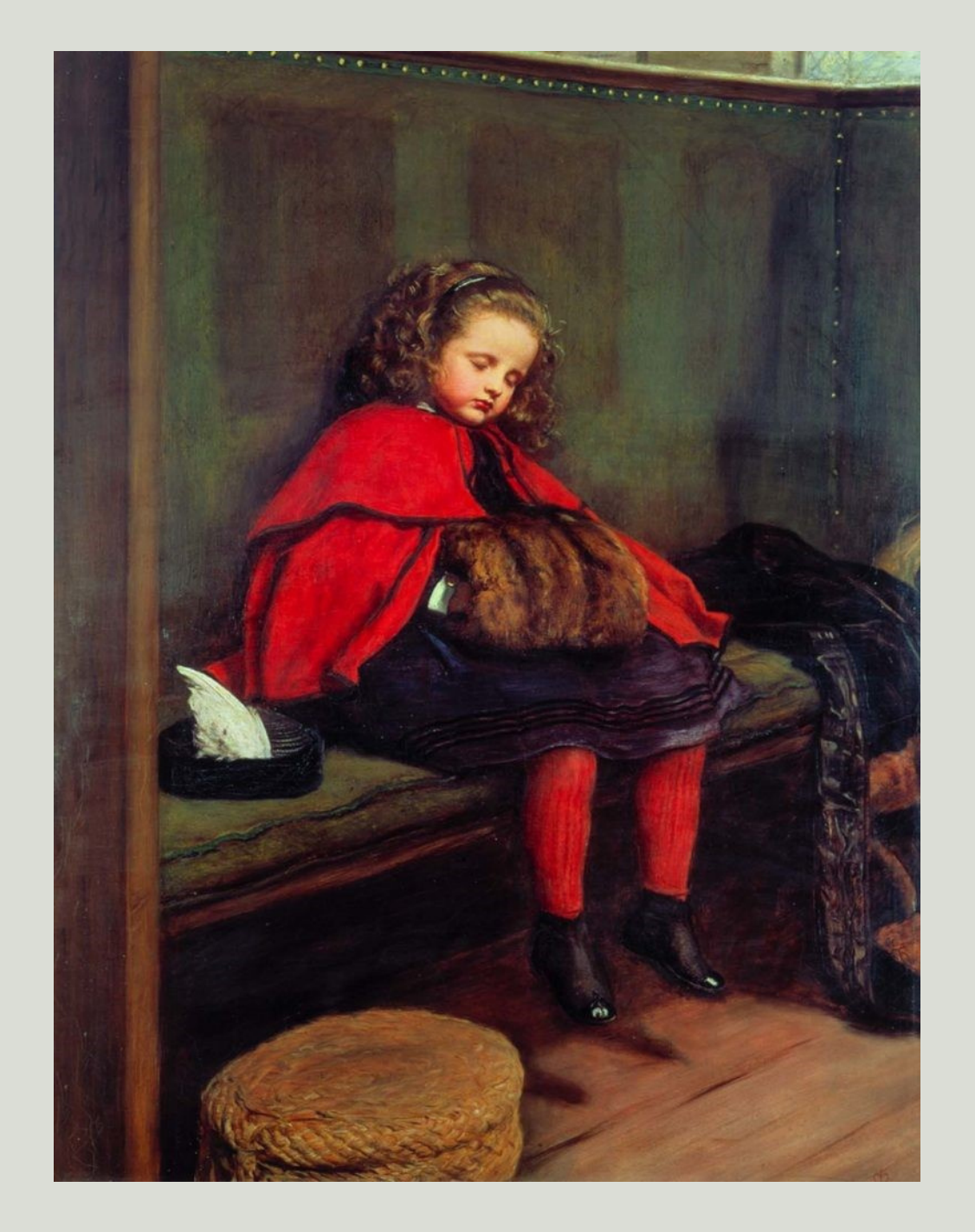
This is a painting painted by Sir John Everett Millais in 1864.

There is a girl sitting on something. There are red, brown, purple, white, and black colours. I see the girl is sleeping on that big stool. She has a red dress. I think she is holding a brown dress. I can see something black with something white in it to the right of the girl. She has black shoes and red socks.