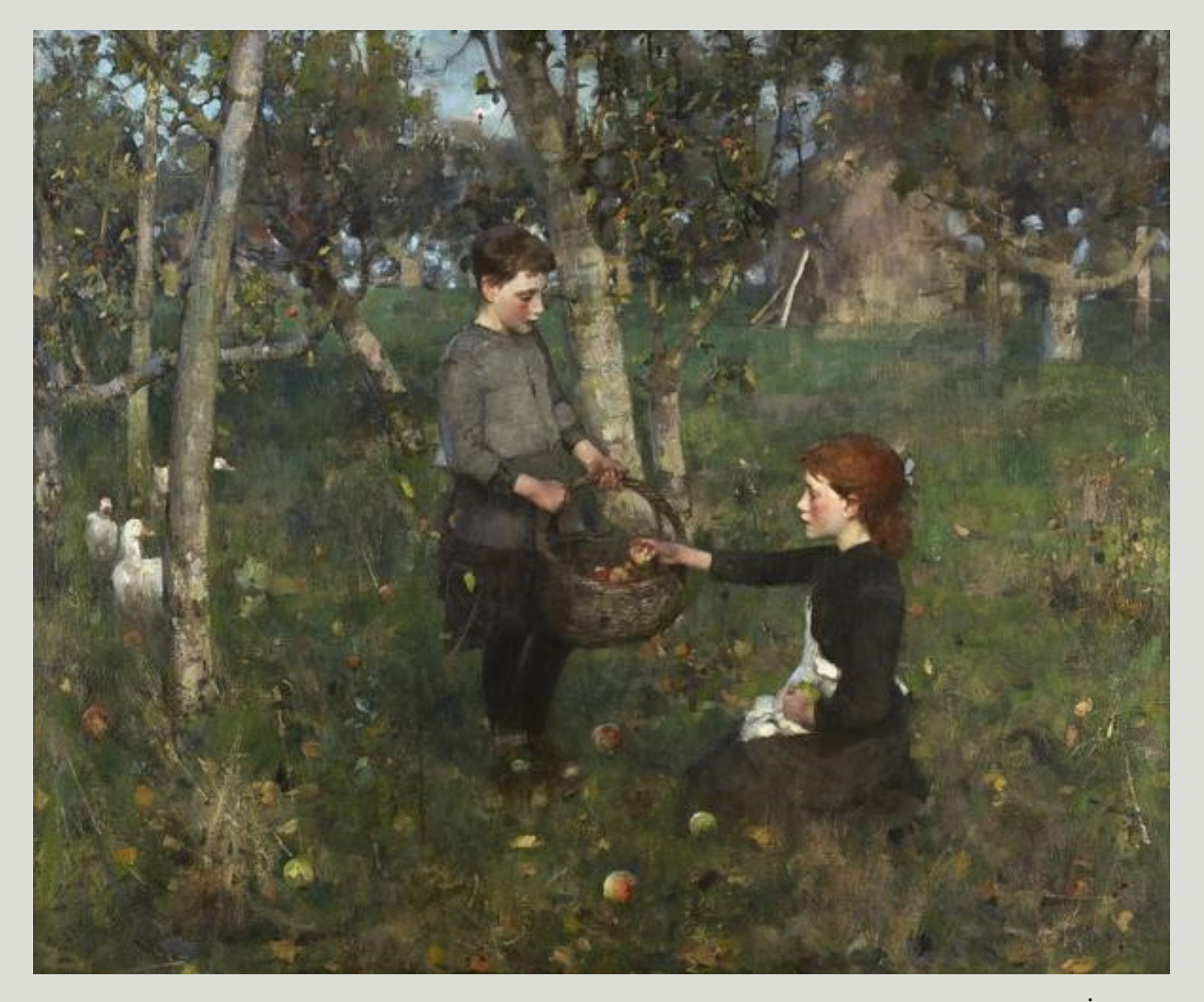
This painting was made by Sir James Guthrie in 1886. This painting is called 'İn The Orchard'.

The painting looks realistic. The artist used the colors very well. In the painting there is a girl and a boy. The boy has a basket and the girl is putting leaves or berries into the basket. The artist used cool colors. \dot{I} think it's morning because the sky looks bright. On the left, there are white shapes. I think they are ducks. The forest kind of looks like the forests in movies.