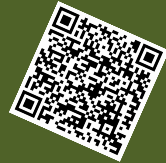
Numbers song 1-10